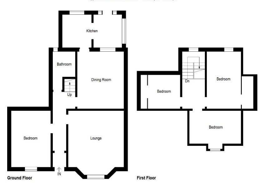
Illustration For Identification Purposes Only. Not To Scale (ID1041742 / Ref.86998)