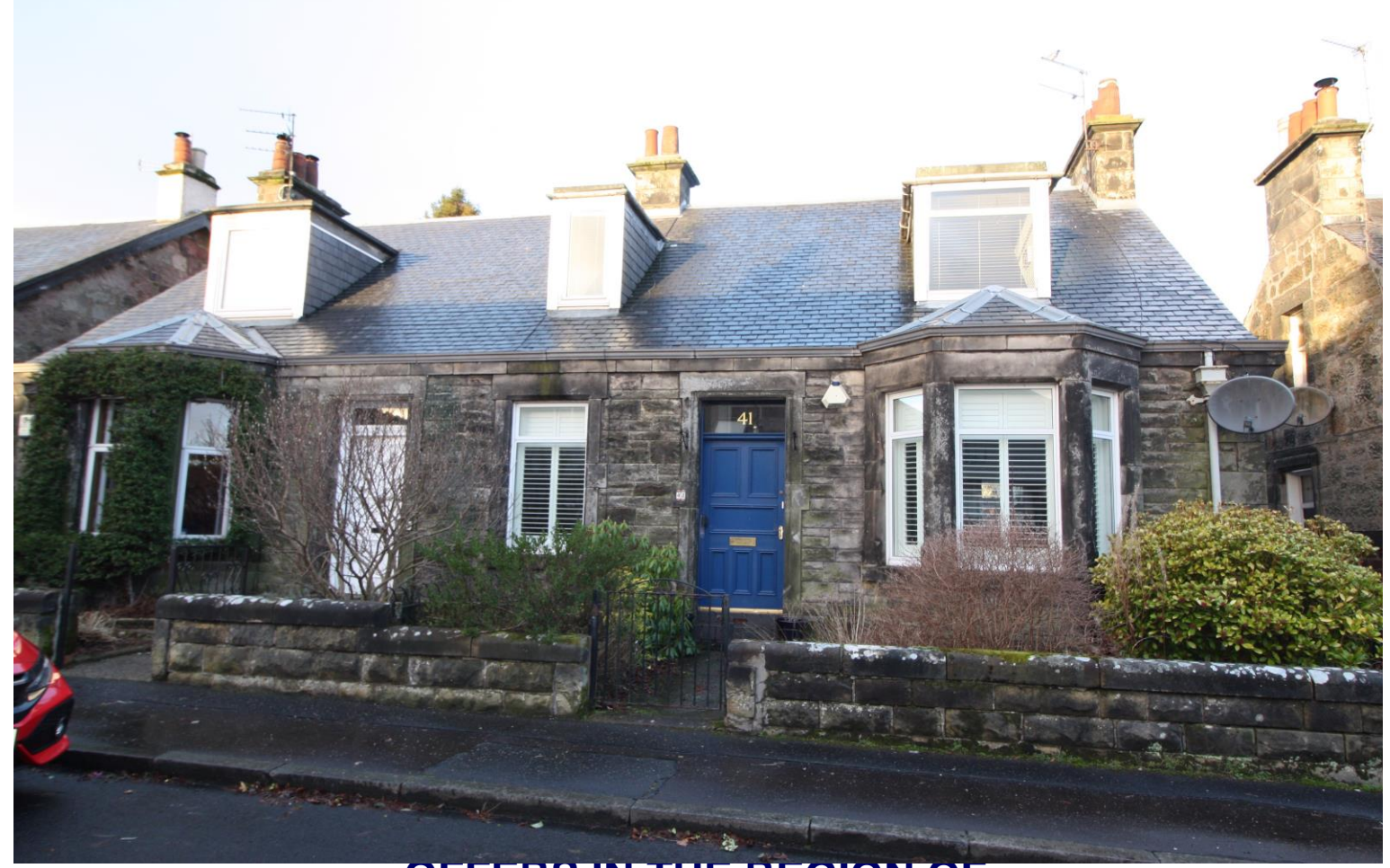
OFFERS IN THE REGION OF £240,000

Well maintained traditional semi-detached villa set within the popular town of Alloa.